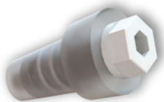
V-40 all plastic valve

The HDF9 fender is rotomolded from a strong, 8 mm thick semisoft thermo-plastic material produced in one piece with extra reinforced ropeholds. The HDF fender is a strong, durable air-filled fender for commercial crafts.